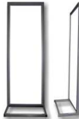
LED Edge-Lit Light Panel used as back lighting in retail light fixture