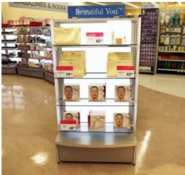
End cap fixture lit with DVT Panels