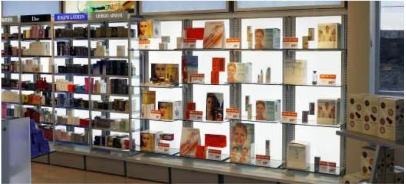
Major pharmacy chain