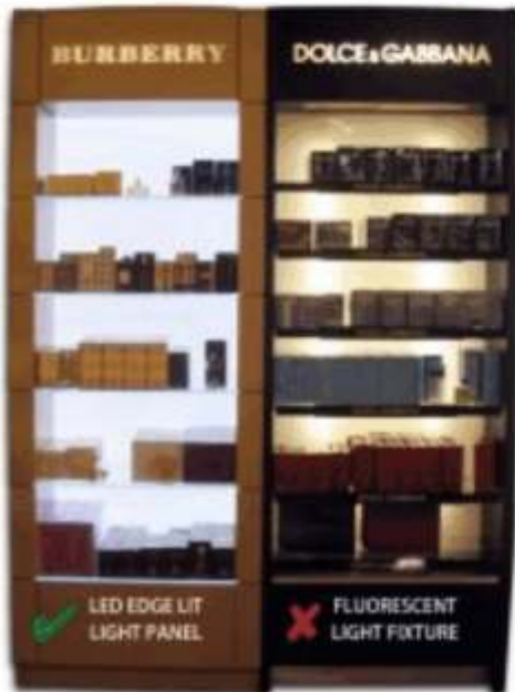
DVT LED Edge-Lit Light Panel vs. Traditional Fluorescent Tube Back Lighting

When compared to traditional fluorescent tube lighting, DVT LED light panels use up to 80% Less Energy.