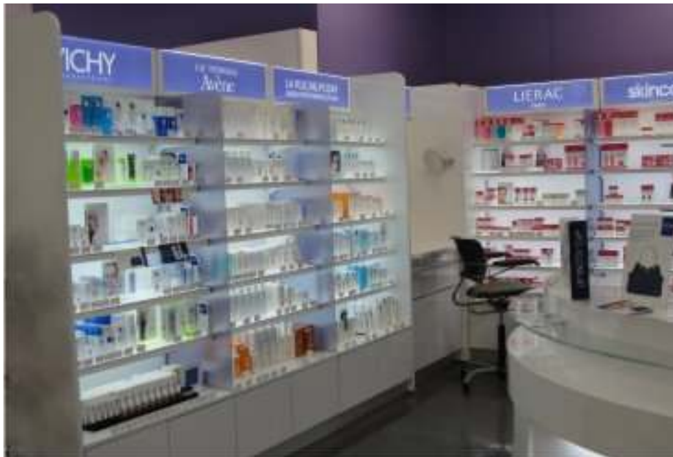
DVT Panel used as shelf and header lighting