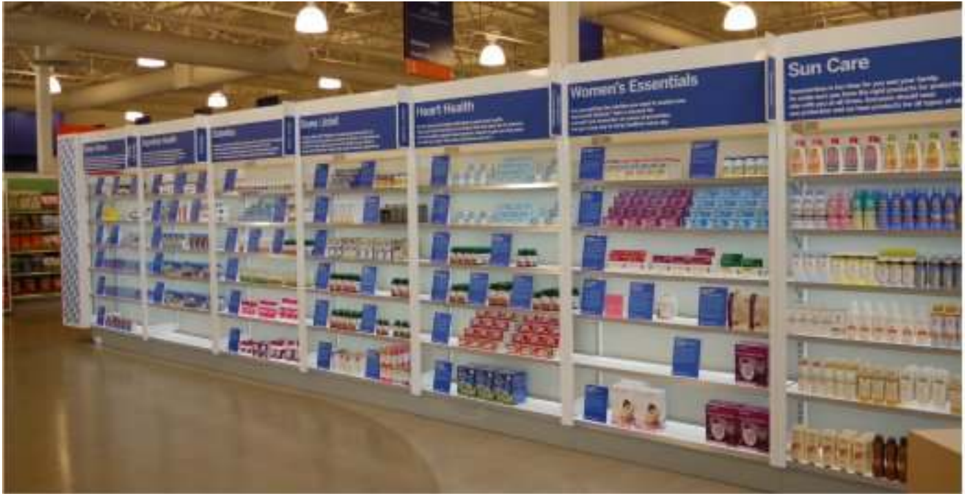
Major drug store retailer