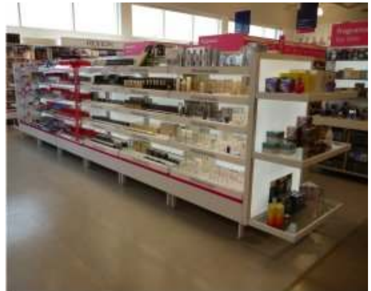
Fixtures fully lit with DVT LED Panels, end cap and headers