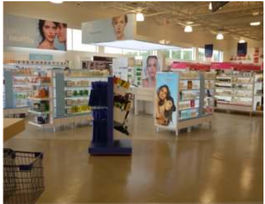
Fixtures fully lit with DVT LED Panels, end cap and headers