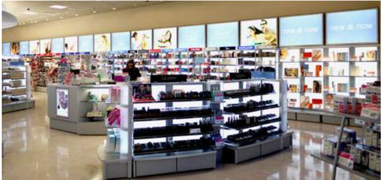
Major drug store retailer

Ultra Brite & Ultra Slim Edge-Lit LED Light Panel