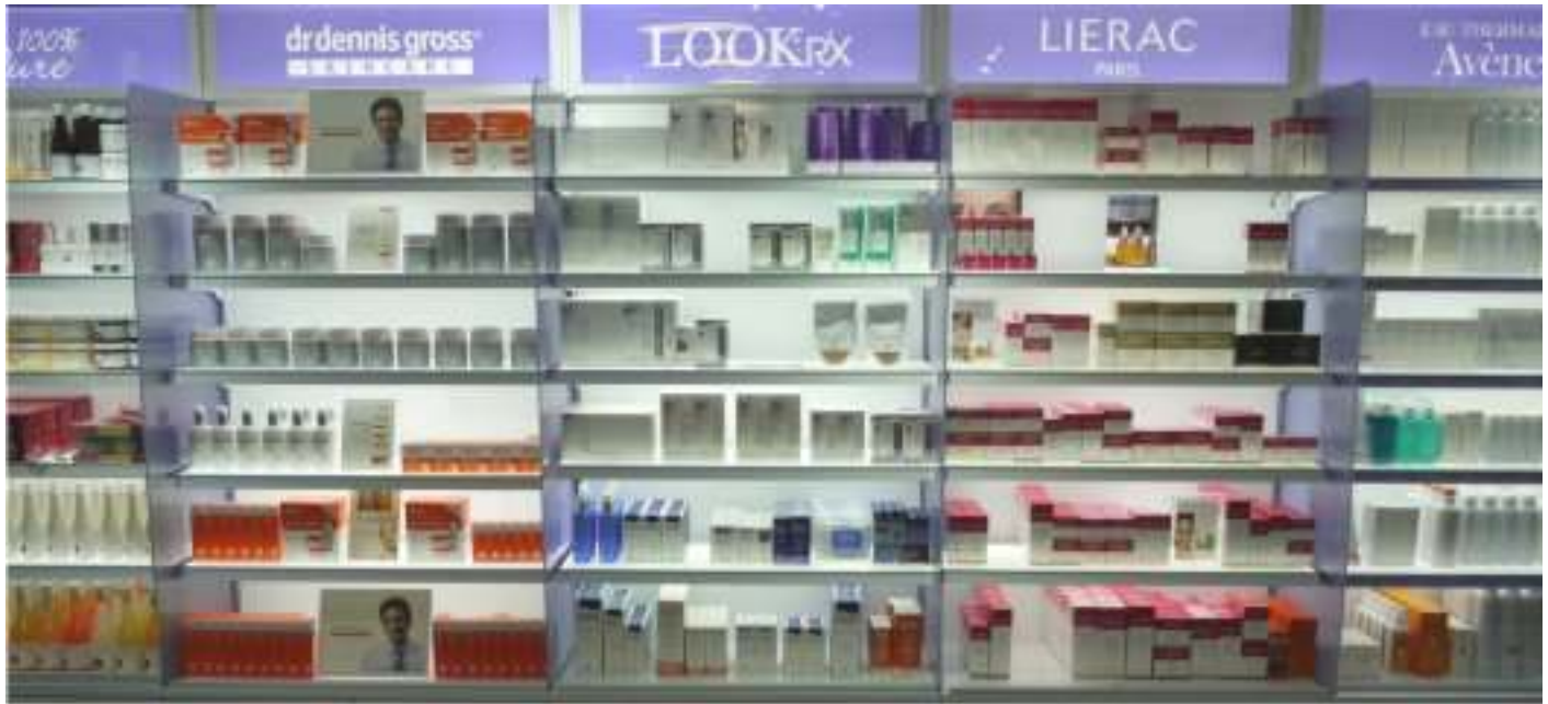
Major drug store retailer

Ultra Brite & Ultra Slim Edge-Lit LED Light Panel