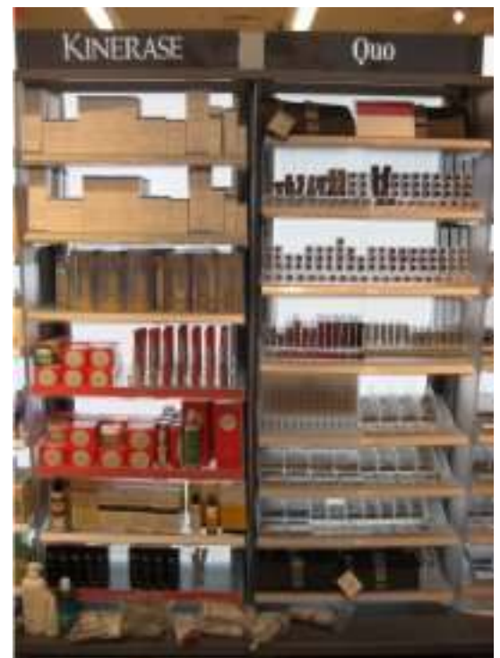
Back lit with DVT Panels