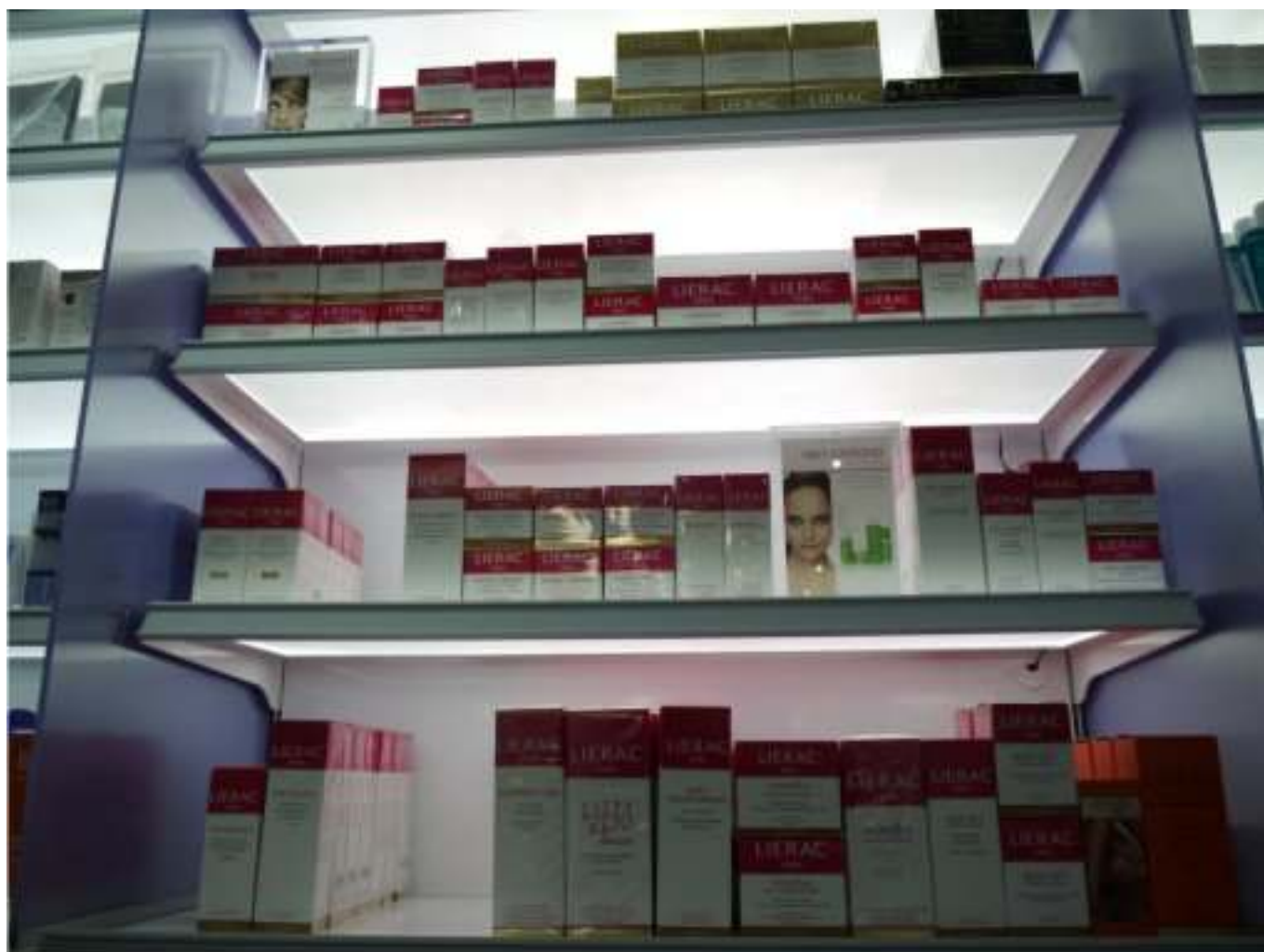
Double-sided DVT LED acrylic shelf as light source

Ultra Brite & Ultra Slim Edge-Lit LED Light Panel