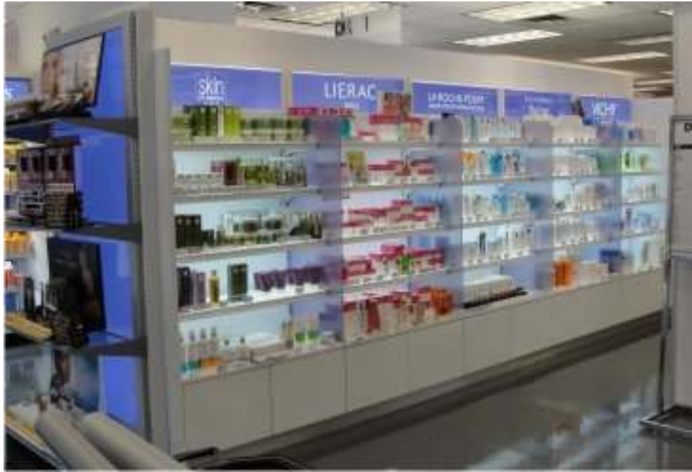
Major drug store retailer gondola