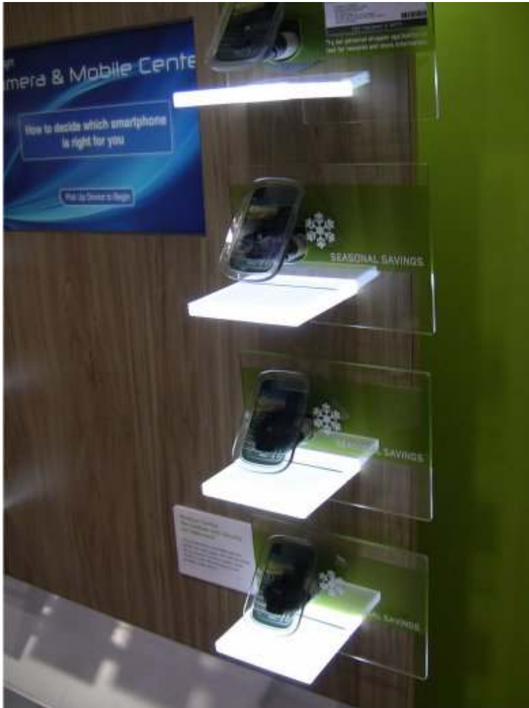
Custom LED shelf for merchandising

Ultra Brite & Ultra Slim Edge-Lit LED Light Panel